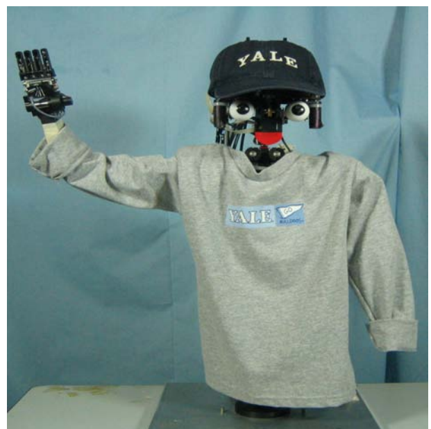
Fig. 2. The upper-torso robot Nico inside the laboratory setup.

3) The Robot Nico : The robot used throughout this experiment was an anthropomorphic upper-torso robot designed with the proportions of a one-year old child, named Nico [14]. Although Nico's construction is not concealed, Nico has a friendly, non-threatening face. The robot wore a (child's) sweatshirt and baseball cap during the interactions (see Fig. 2). Nico's head has a total of seven degrees of